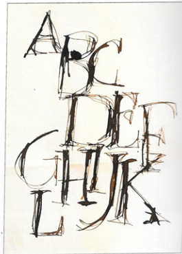
BETTY BAX "Mix" 11 x 14 inches

Folded portfolio cover made with Arches Cover and walnut ink squeezed through a syringe while moving.