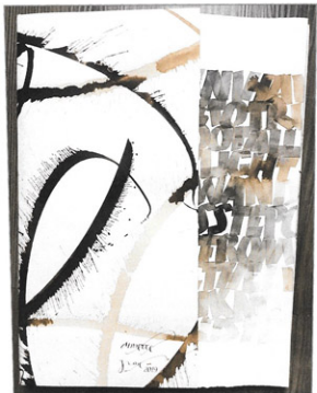
ANNETTE WICHMANN "Mix" 10 x 14 inches

Folded portfolio cover made with Arches Cover and walnut ink squeezed through a syringe while moving.