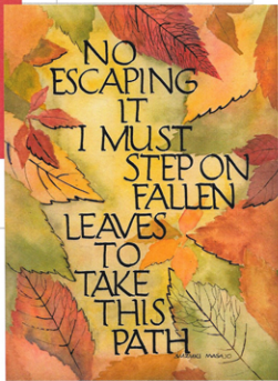
Cathy Bauer - Arches 140lb, 9x12 inches, watercolours, Higgins ink with dip pen.