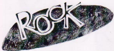
▲ Kerri Pencil drawn.

THE WILL TO BE! stupid IS A POWERFUL FORCE